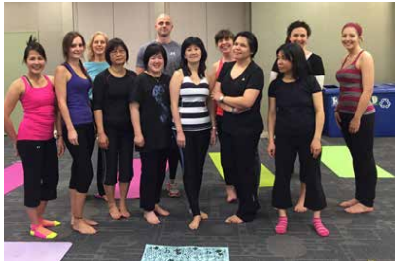
Some highlights of our year: the Vancouver Sun Run (far left), wine and cheese event with new strata client (top), staying healthy during Smoothie Day (immediate left) and Office Yoga Team.